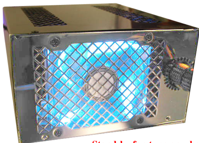
Stand-by fan turn on when load is high

A/C Input 100-120Vac/200-240Vac 10/6A 60/50Hz